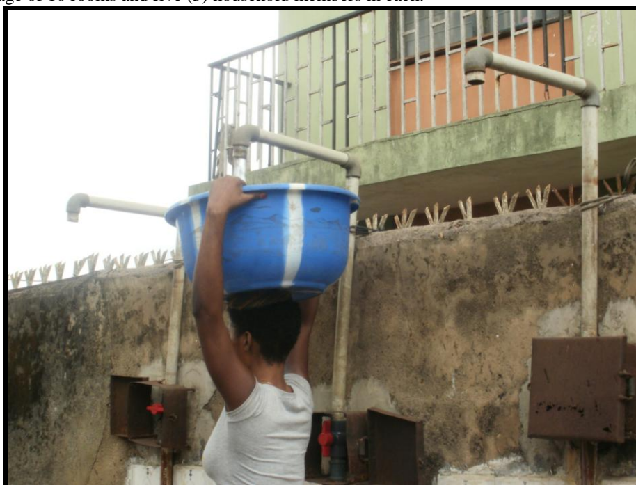
Figure 2. Individual Fetching water with an open container at a commercial borehole stand-post

bathing, cleaning, washing and other general use but without drinking. Most residents buy the popularly called “pure water sachet” for their consumption while some are indifferent, with the mindset that the water they drink would not kill them. Most house types are the long informal type of building popularly called “face to face” with an average of 10 rooms and five (5) household members in each.